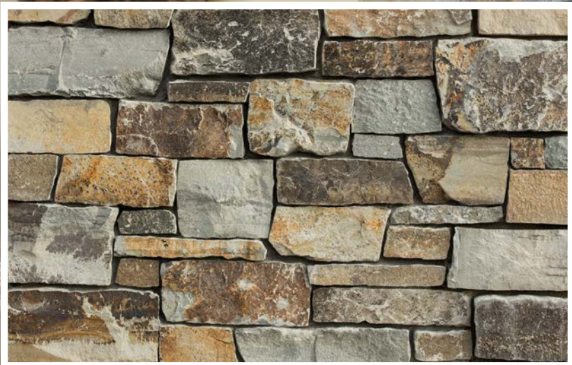
Rocky Mountain Gold Ledge Veneer Courtesy of Carlos Alvarez Masonry

This is an exceptional building stone offering the beautiful warm color blend variety of browns, gold tones, bronze, tans and grays.