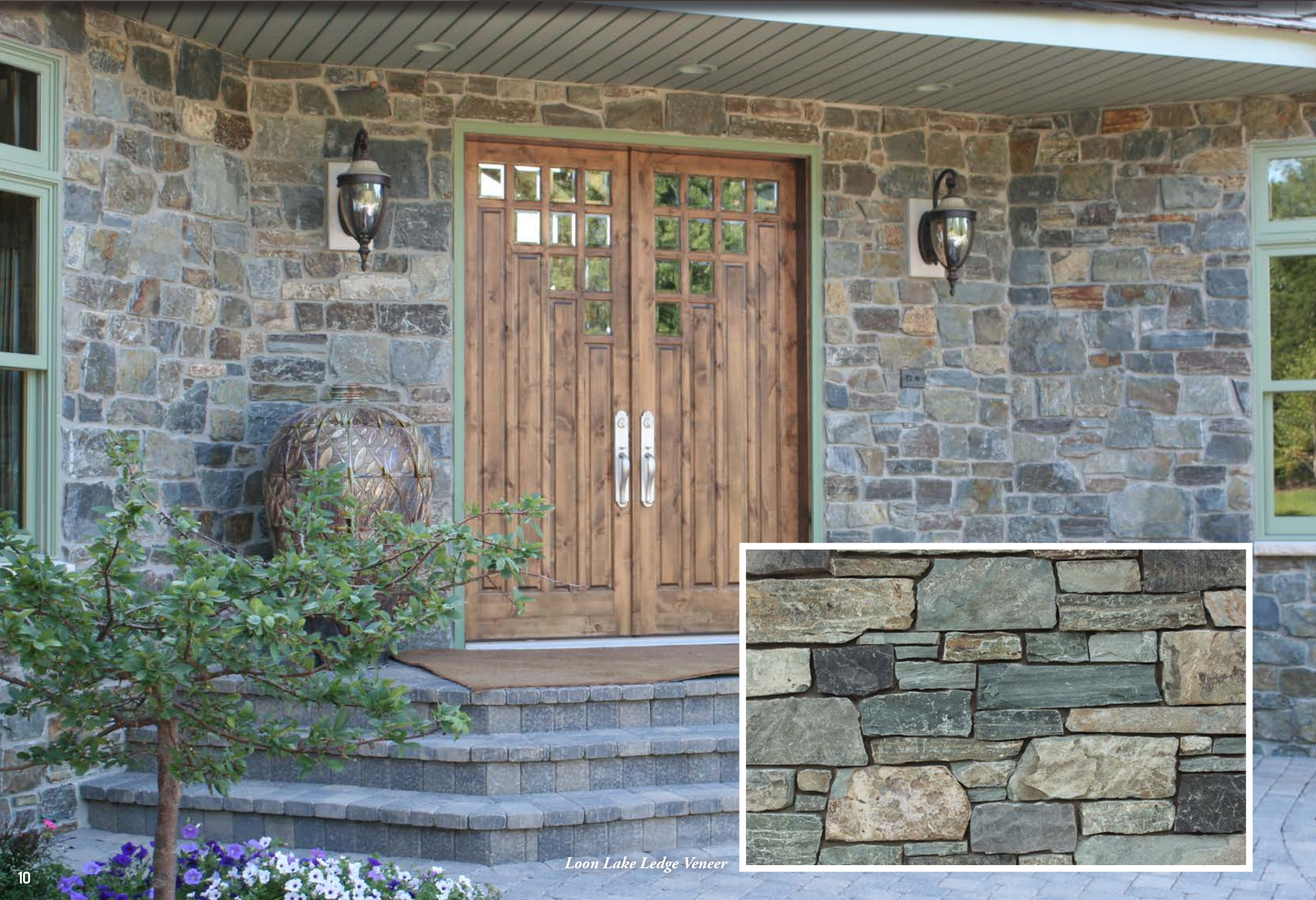
Loon Lake Ledge Veneer

Loon Lake is unique to Glacier Stone and comes in a wide array of colors including blues, greens, bronze, browns, tans and slate grays with subtle sedimentary striations.