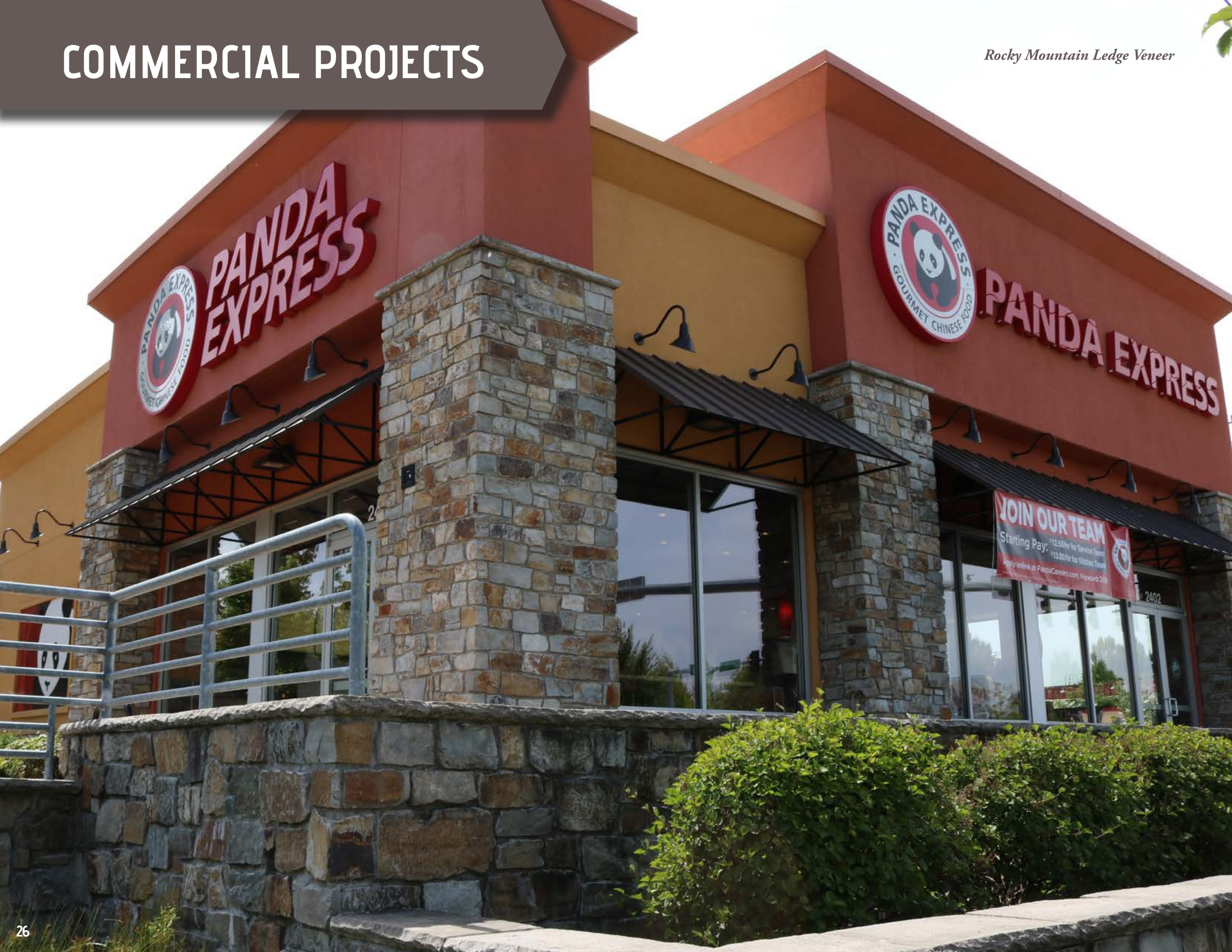
Rocky Mountain Ledge Veneer