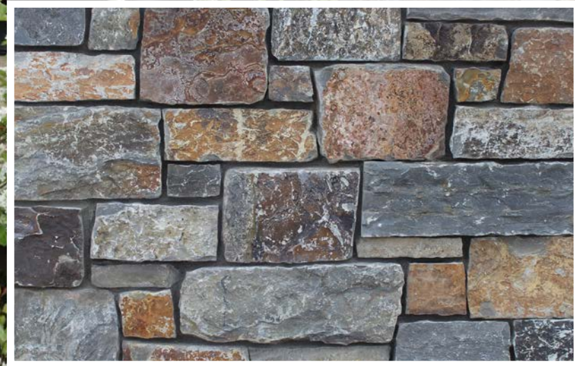
Bitterroot Ledge Veneer

The Bitterroot family of stone features vibrant hues of burgundy, rust, gold and bronze set against a neutral background of grays and browns.