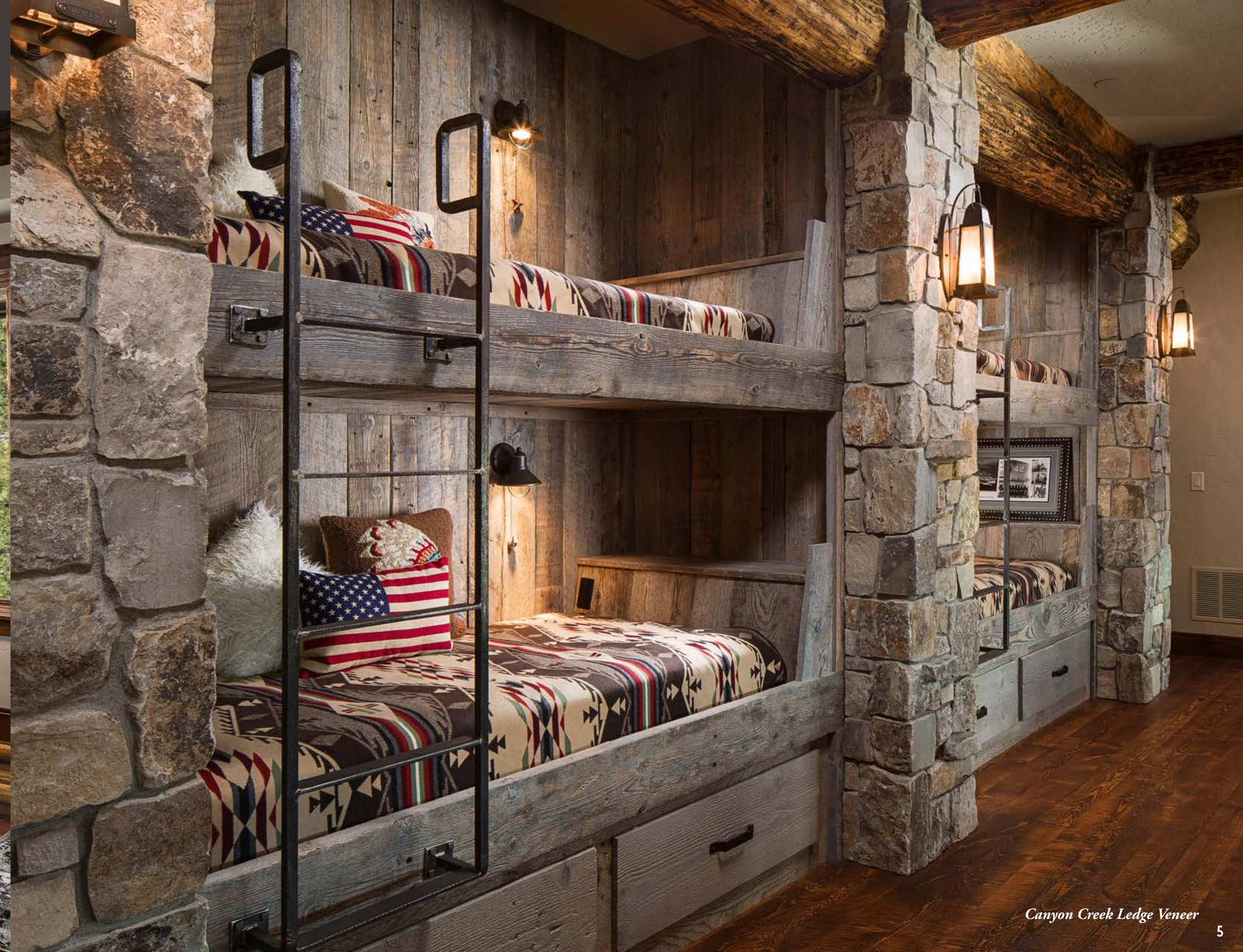
Canyon Creek Ledge Veneer