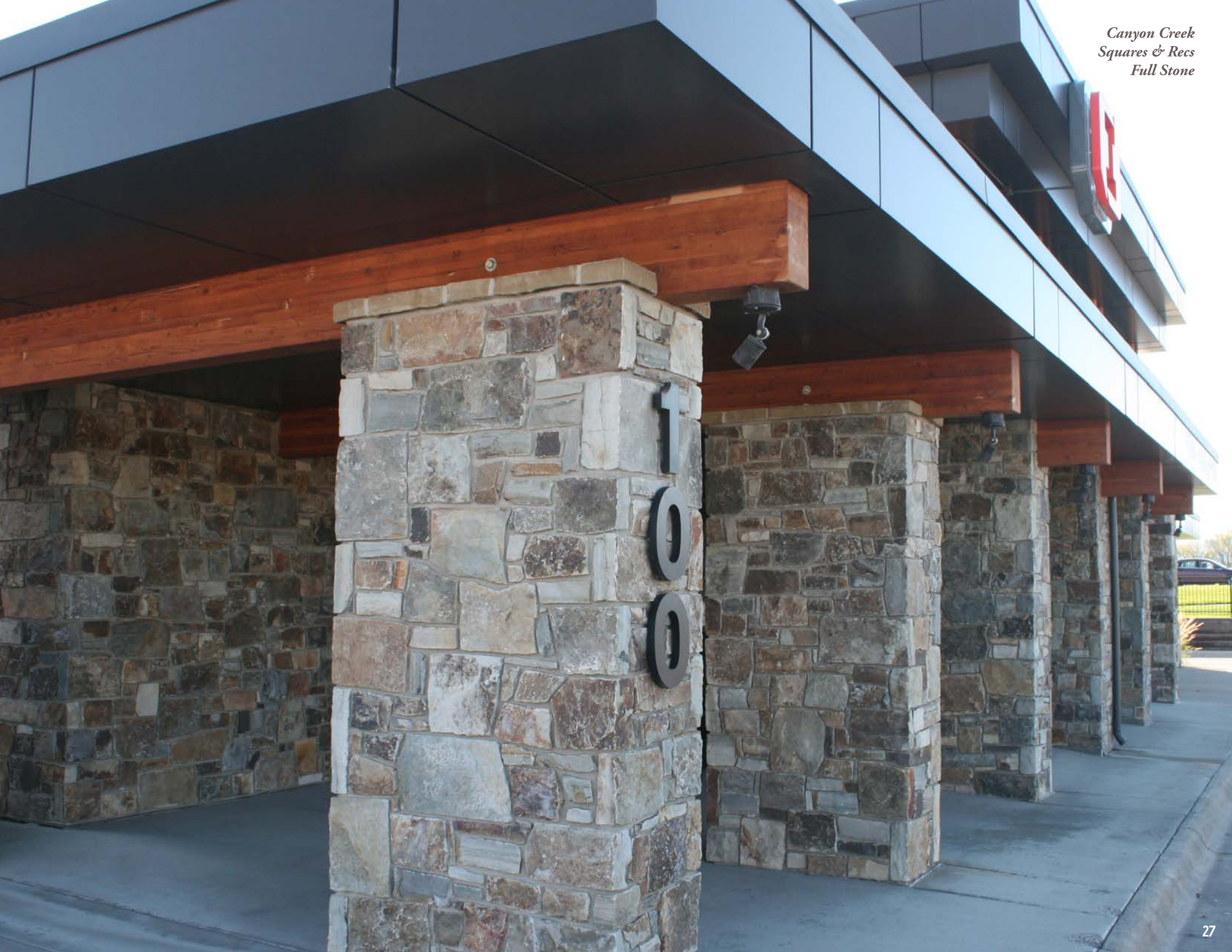
Canyon Creek Squares & Recs Full Stone