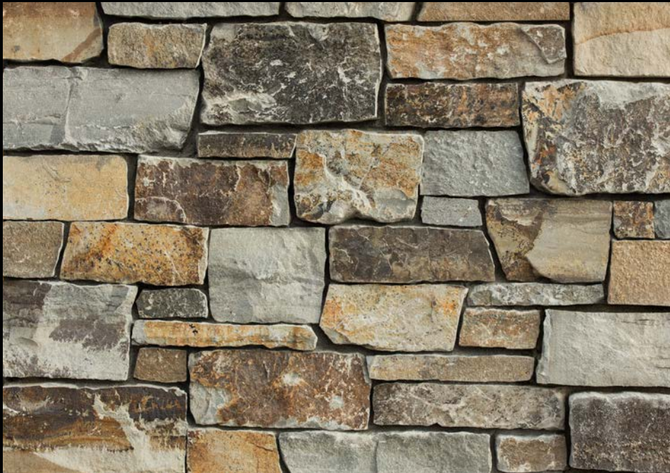
ROCKY MOUNTAIN GOLD