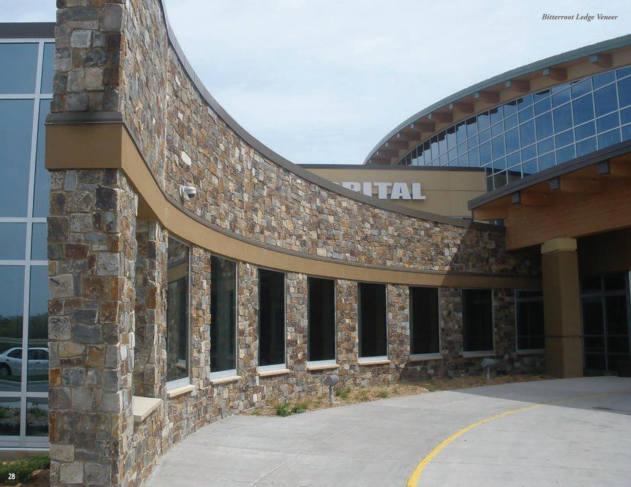
Bitterroot Ledge Veneer