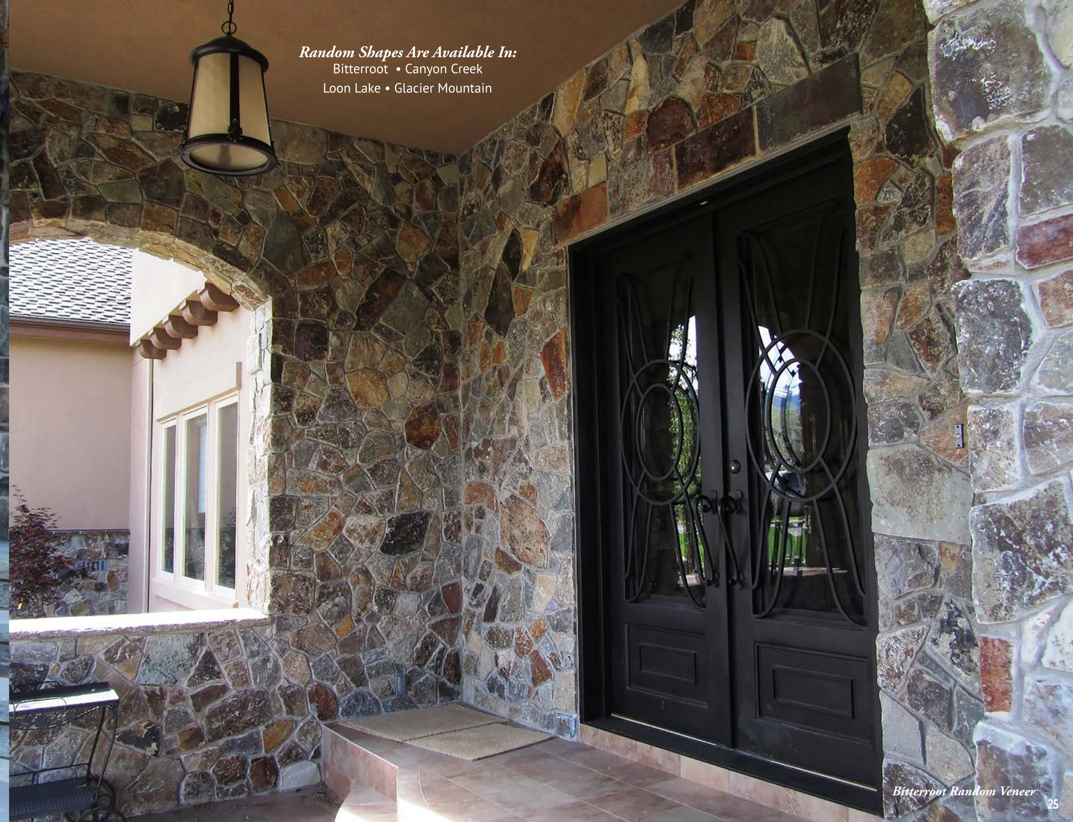
Random Shapes Are Available In: Bitterroot • Canyon Creek Loon Lake • Glacier Mountain