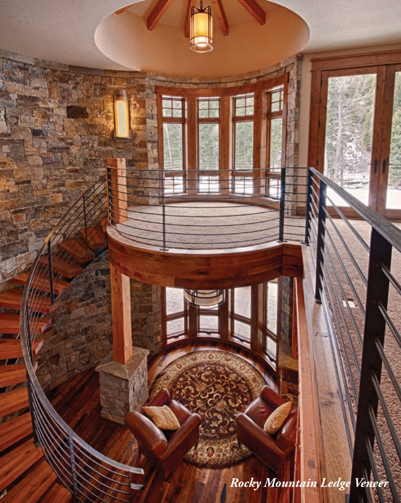
Rocky Mountain Ledge Veneer

This brochure only begins to display some of your natural stone options. Additional stone shape/size options are available as well as custom blends and colors to provide you exactly what your project demands.