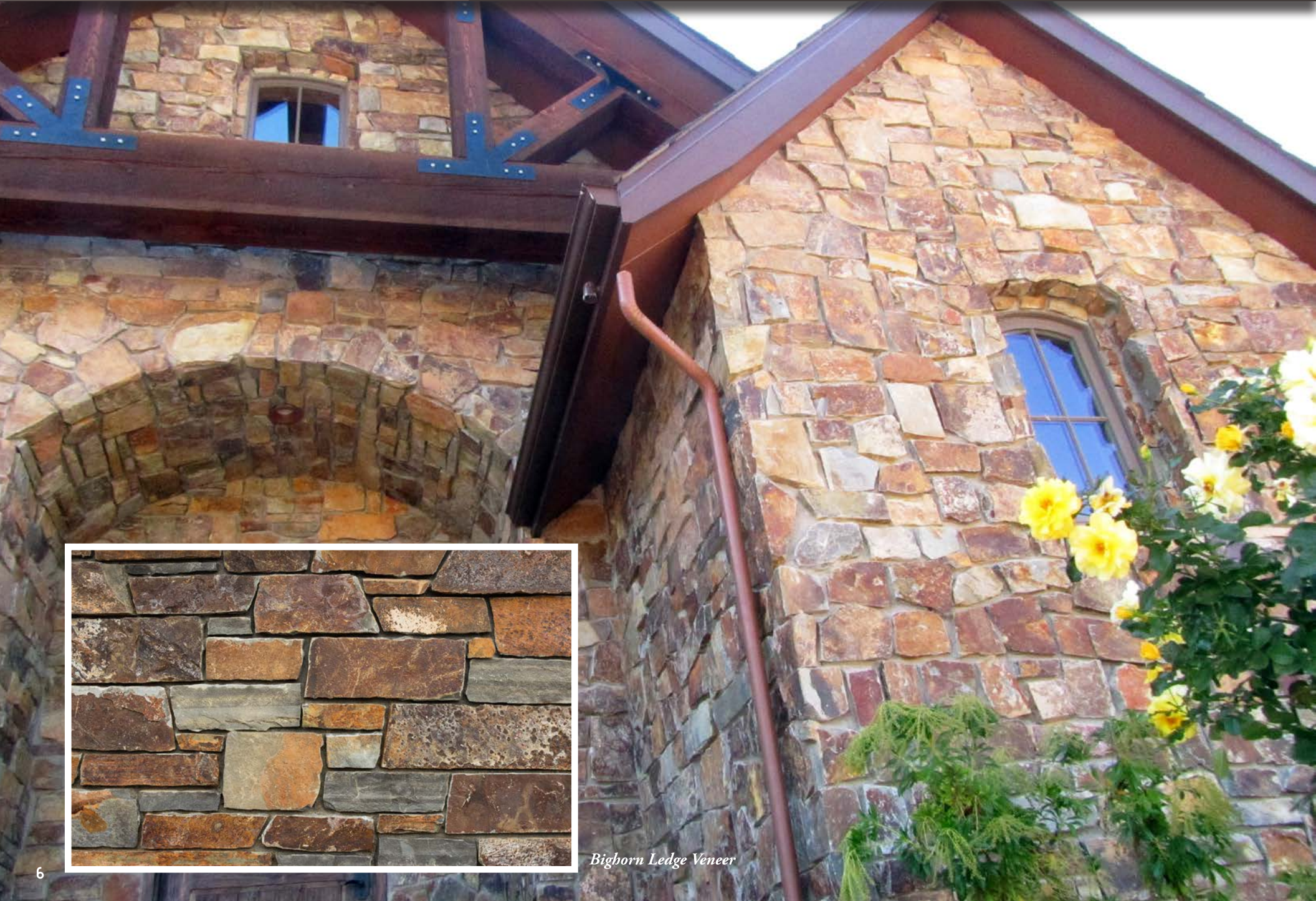
Bighorn Ledge Veneer

Bighorn Creek has a wide range of rich multi-colored hues of rust, bronze and copper created from the stone's iron content. Its core is a blue gray.