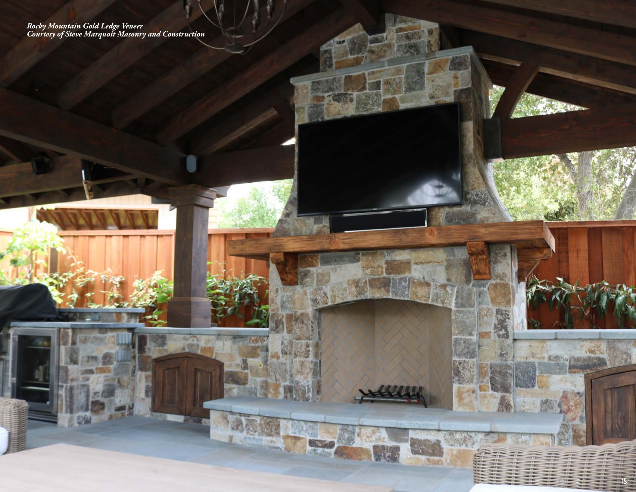
Rocky Mountain Gold Ledge Veneer