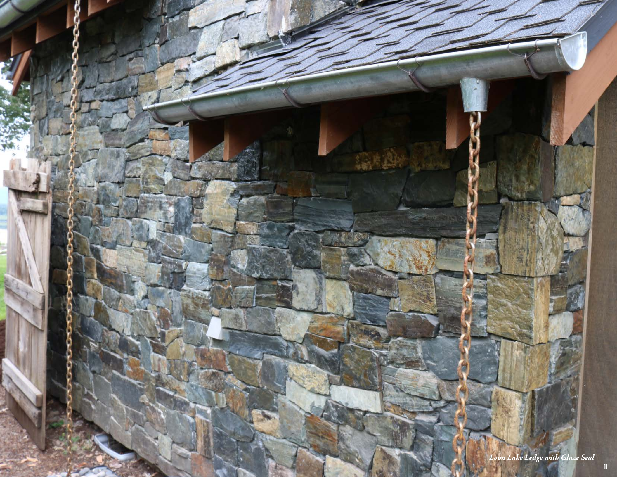
Loon Lake Ledge with Glaze Seal