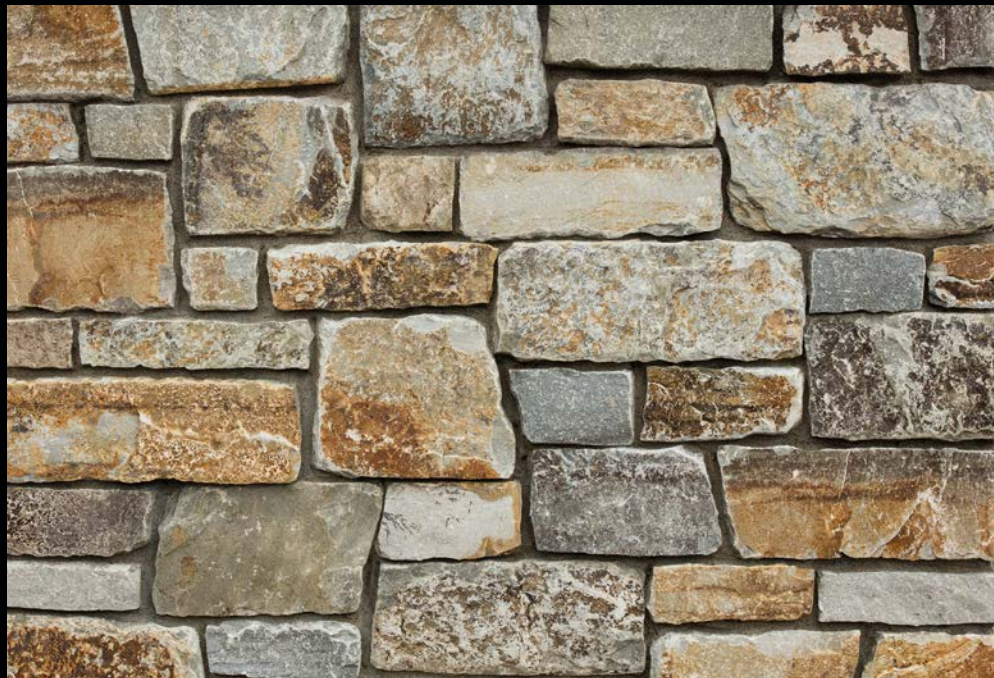
TUMBLER ROCKY MOUNTAIN GOLD