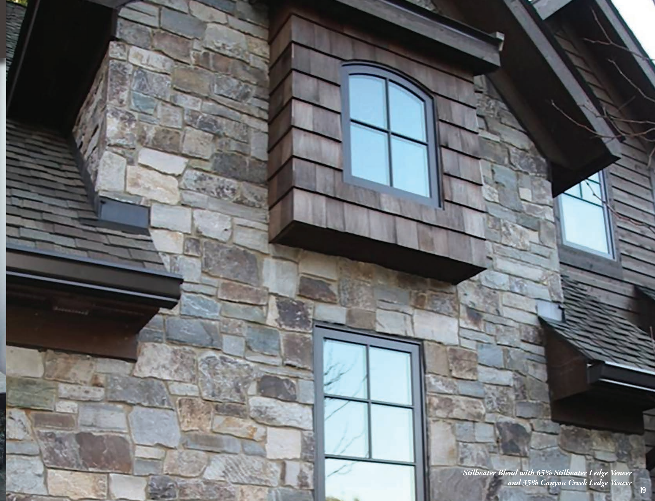
Stillwater Blend with 65% Stillwater Ledge Veneer and 35% Canyon Creek Ledge Veneer