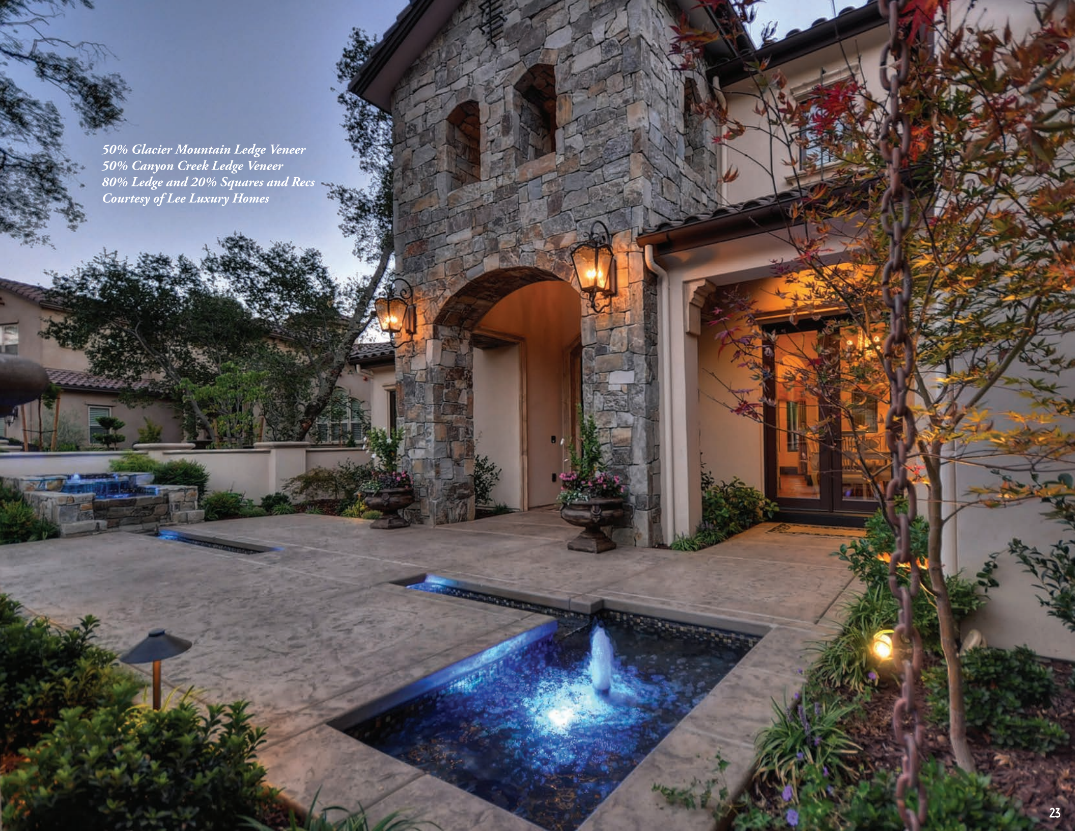
50% Glacier Mountain Ledge Veneer 50% Canyon Creek Ledge Veneer 80% Ledge and 20% Squares and Recs