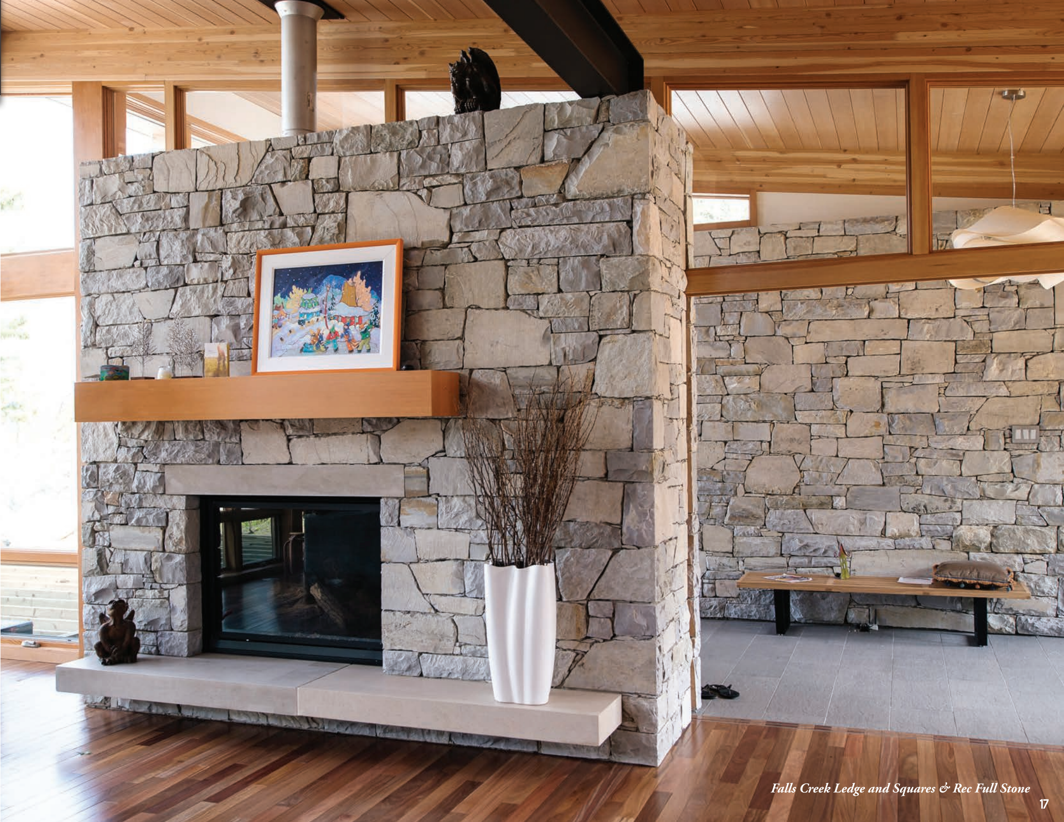
Falls Creek Ledge and Squares & Rec Full Stone