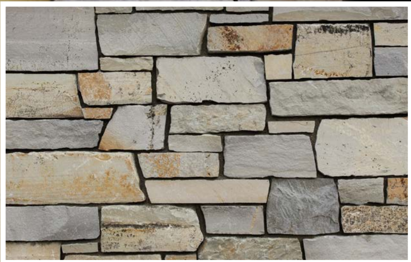
Falls Creek 80% Ledge and 20% Square & Rec Full Stone

Falls Creek is another exclusive stone offering a lighter toned product ranging from light to gold with occasional buff hues accenting the soft, warm textures.