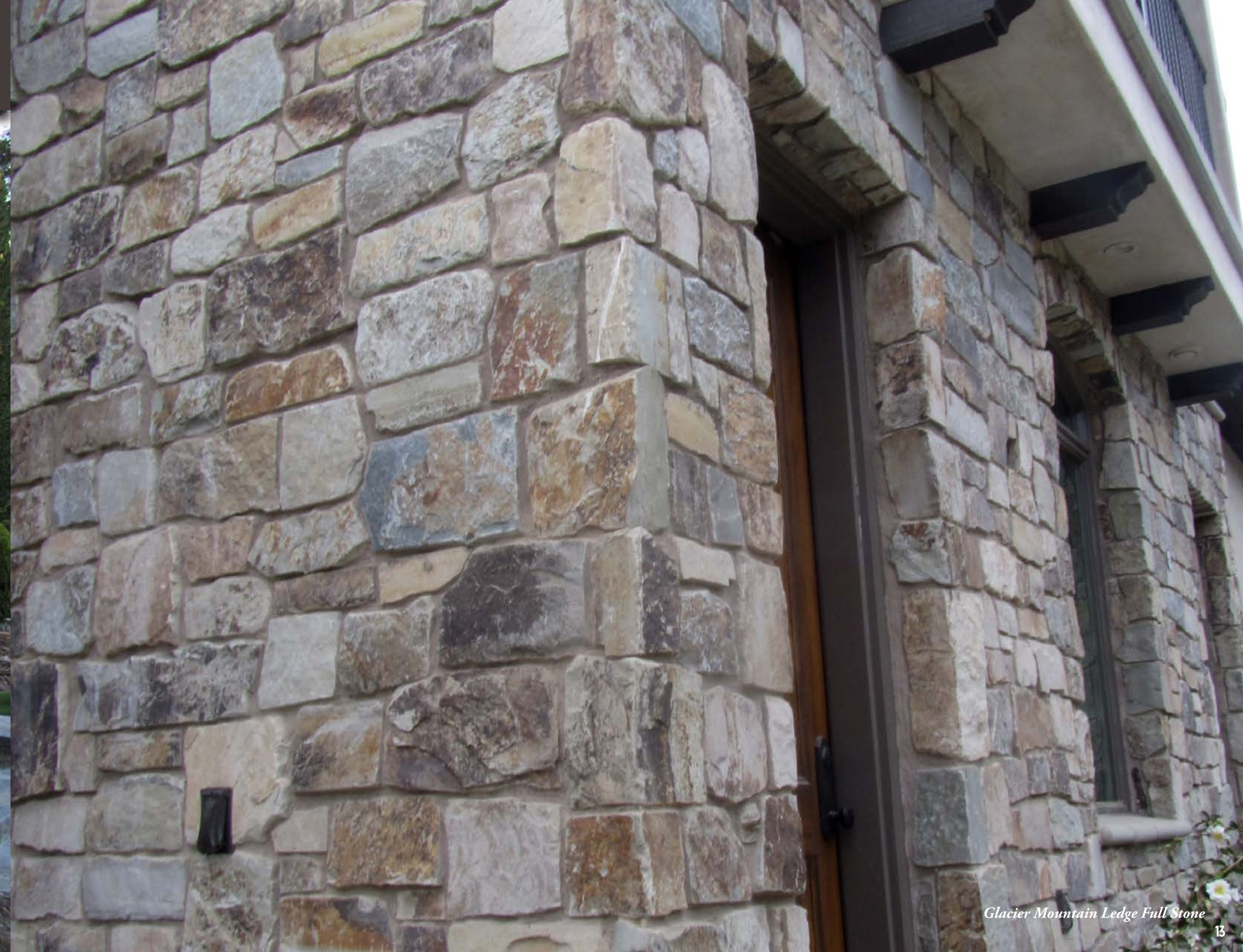
Glacier Mountain Ledge Full Stone