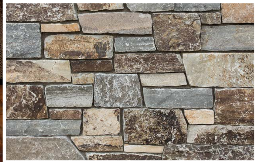
Canyon Creek Ledge Veneer

The Canyon Creek family is one of our most popular stones featuring rich colors ranging from chocolate brown, tans, and blue/gray tones — true to the Northern Rockies.