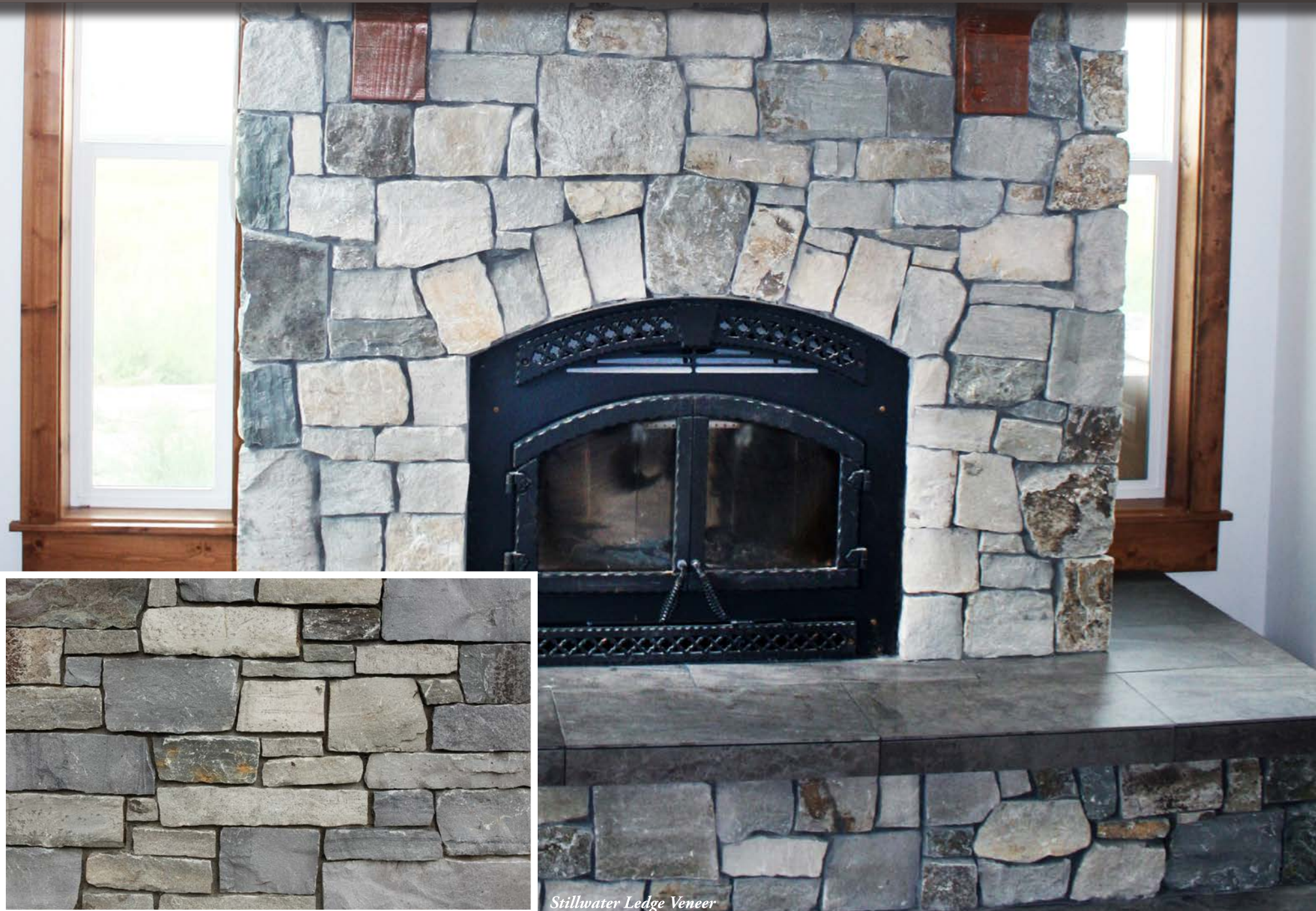
Stillwater Ledge Veneer

Stillwater blend is our split face stone featuring an elegant color palate of mostly varying shades of greys blending well with any style of architecture from contemporary to rustic.