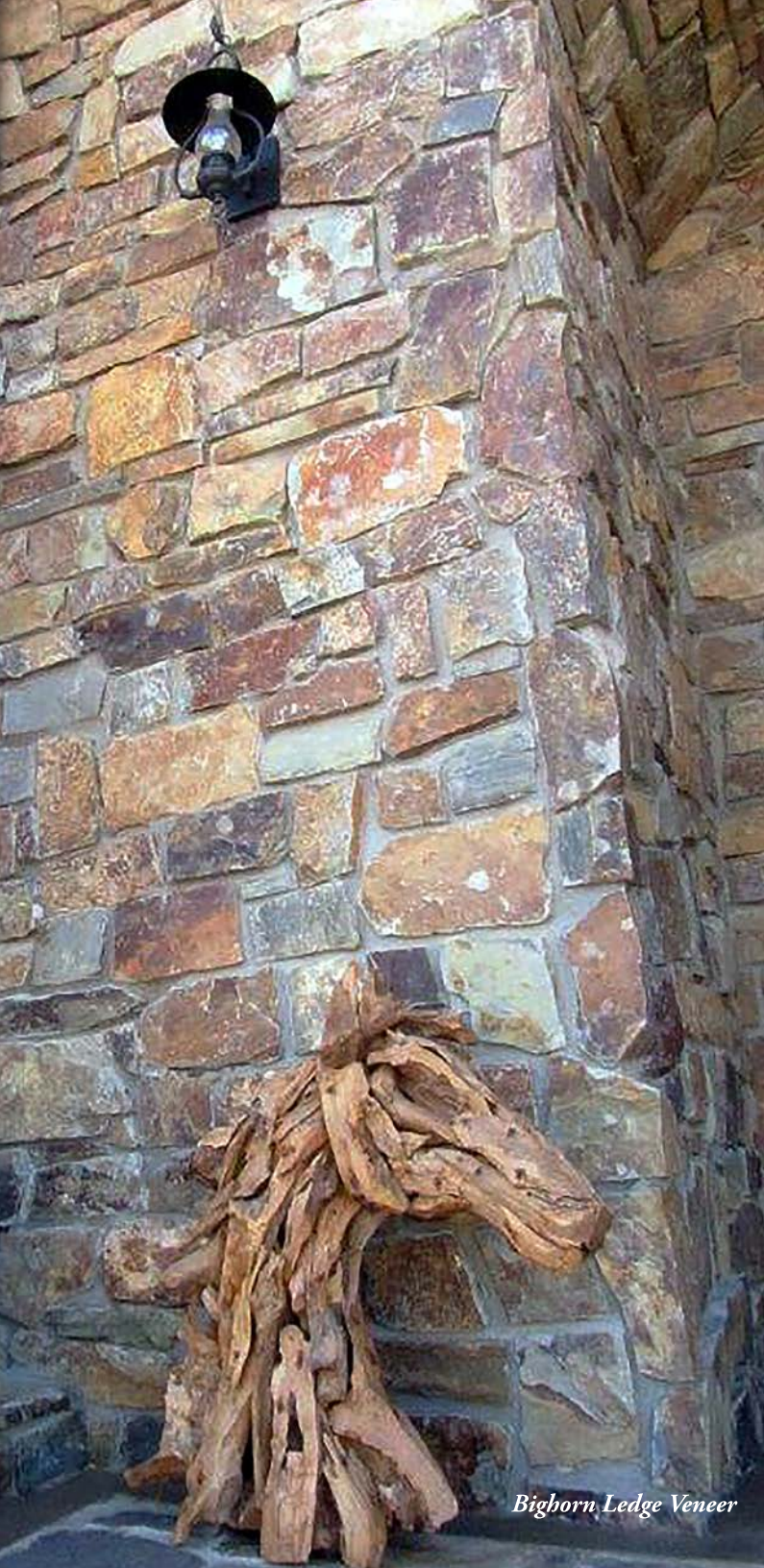
Bighorn Ledge Veneer