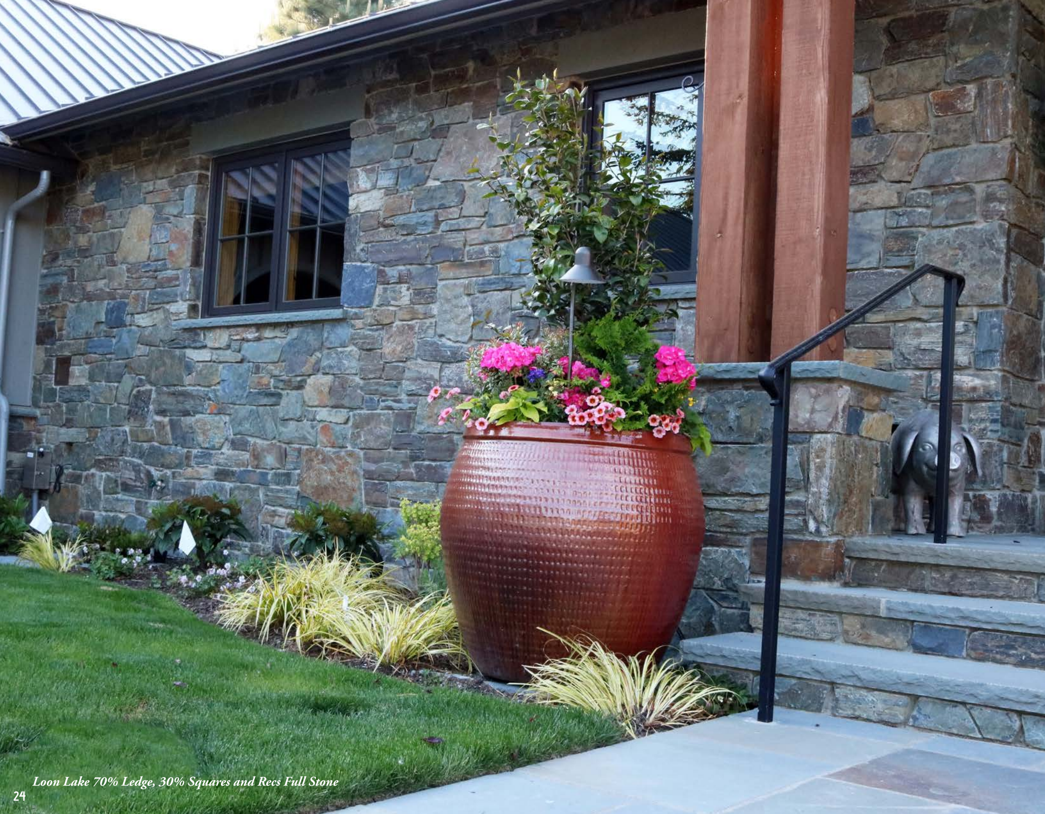
Loon Lake 70% Ledge, 30% Squares and Recs Full Stone