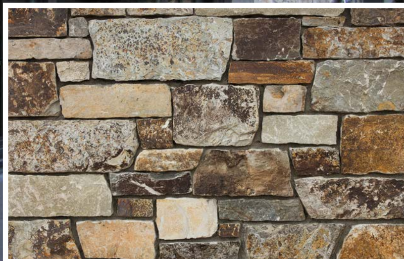
Glacier Mountain Ledge Veneer